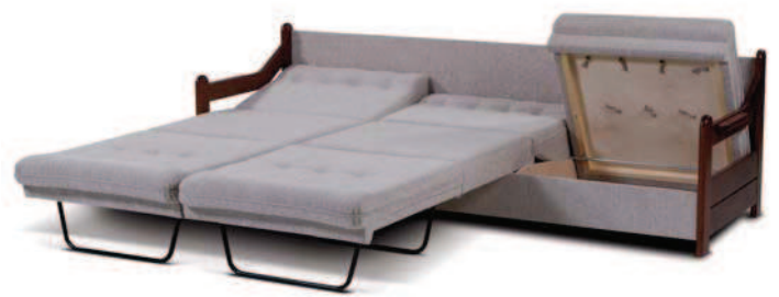
3(2R + 1U) potah: STELA 1/2