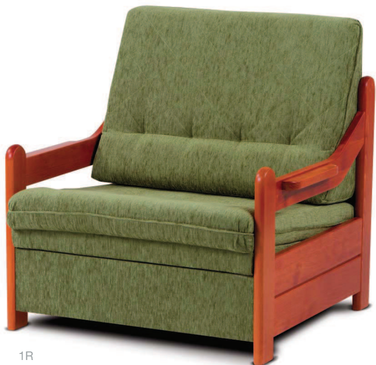
1R potah: ILGI UNI 5